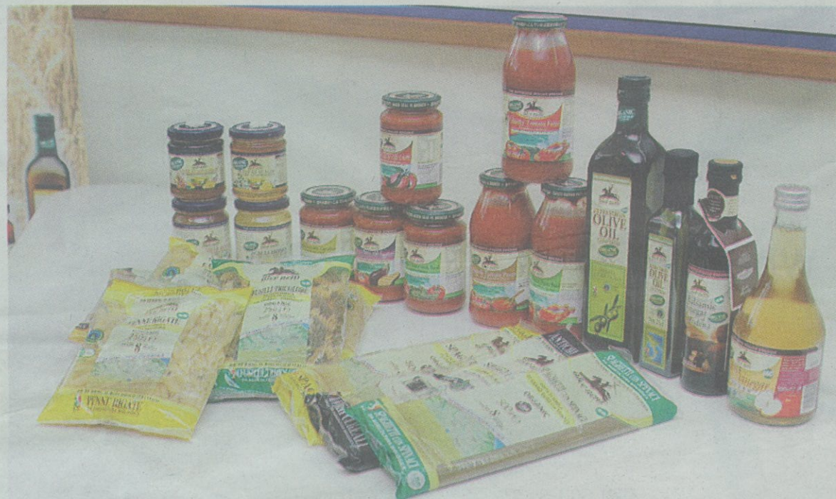
Variety: Organic products that are available in the market.

pesticides or chemical fertilisers. Its organic certification is awarded by the European Organic Certifier, the world's most established and well-respected regulatory body.